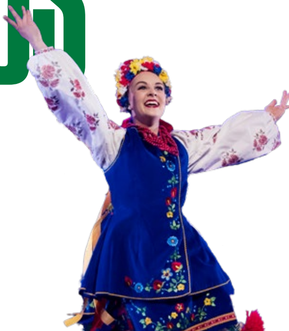
GIVING MACHINES PAGE 10