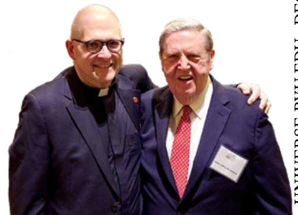
INTERNATIONAL STUDENTS PAGE 11