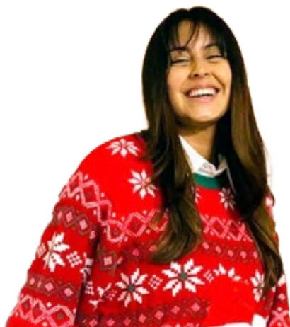
GLOBAL CELEBRATION PAGE 6